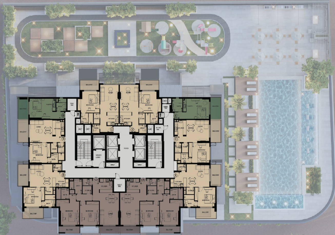
TYPICAL 2nd - 6th FLOOR PLAN