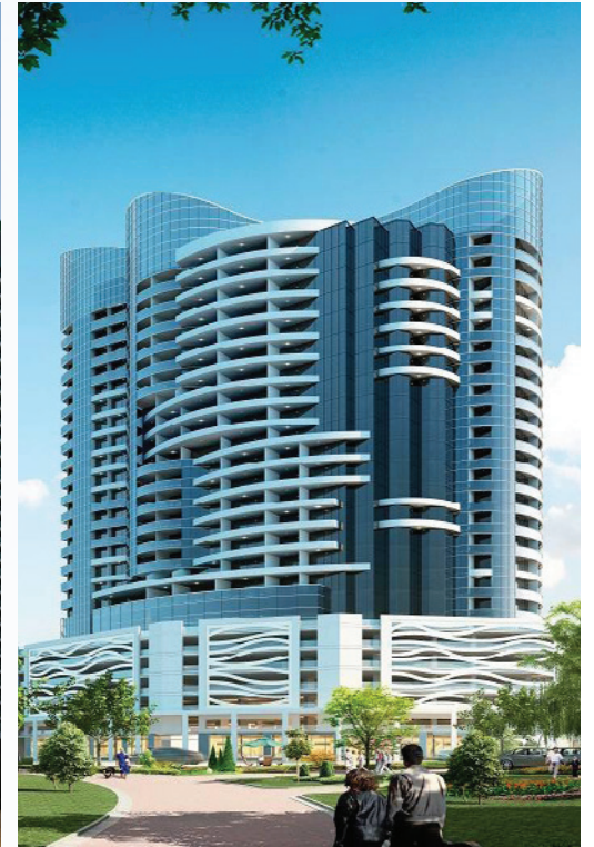
Blue Waves Tower