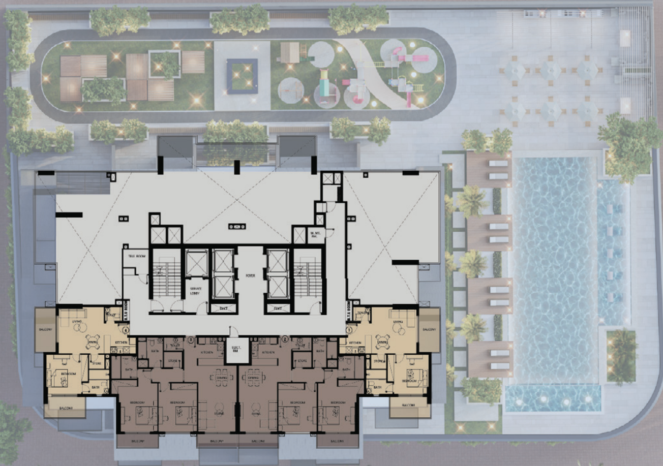
13th FLOOR PLAN