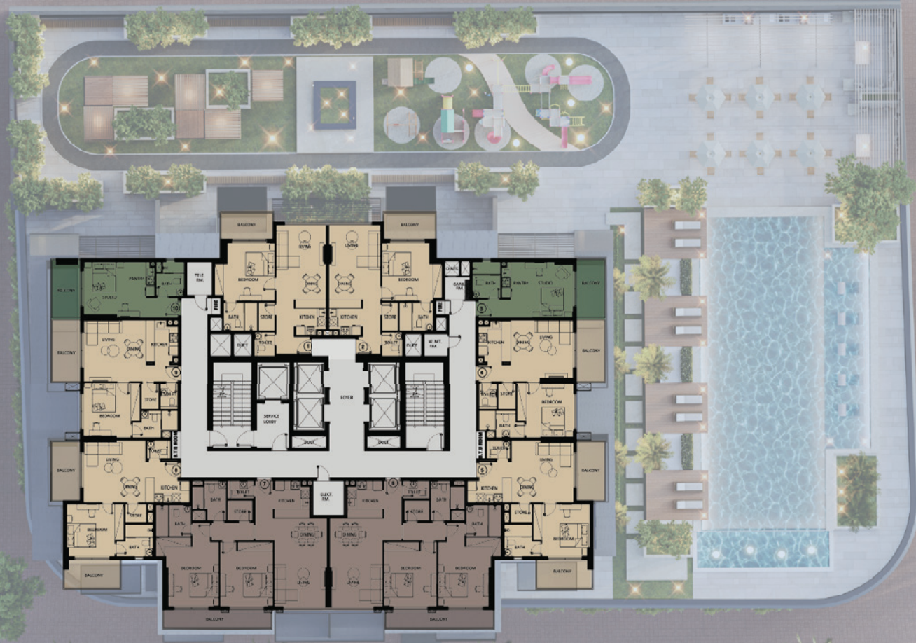
TYPICAL 24th - 27th FLOOR PLAN