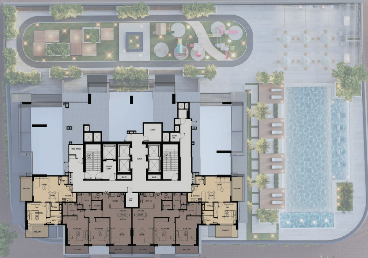
12th FLOOR PLAN