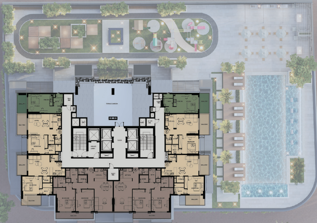
28th FLOOR PLAN