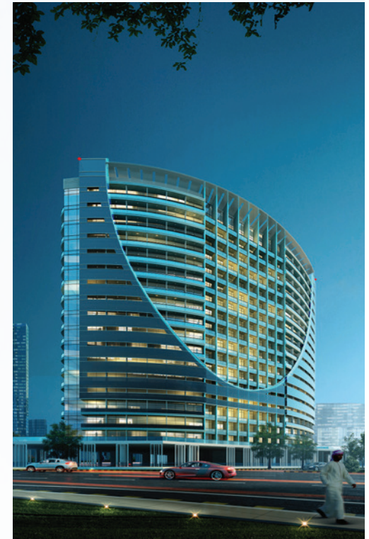
The V Tower