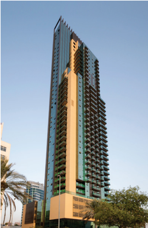
The Square Tower